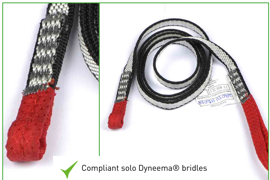
Compliant solo Dyneema® bridles

NB: It is not necessary to deploy the parachute or to disconnect the bridles from the harness to execute this check.