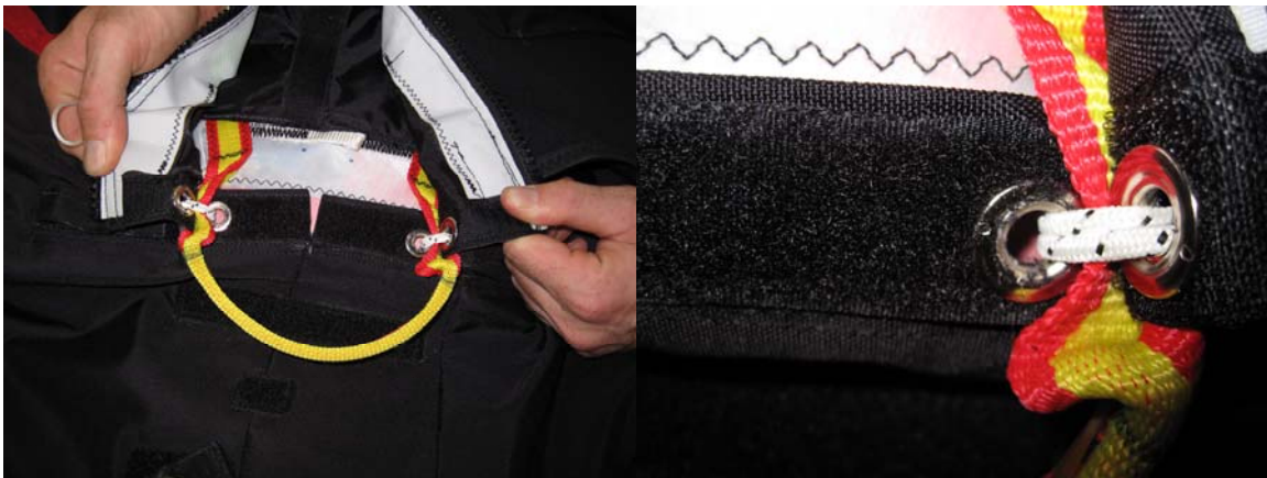
Incorrect-Handle on the outside of the grommets and bungee

Your parachute should be installed as per the manufacturer's instructions or as per the Matrix manual. One other point to note is that the handle should be routed on the inside of the two grommets. This helps spread the zip. If the handle runs on the outside, it instead bunches the zip.