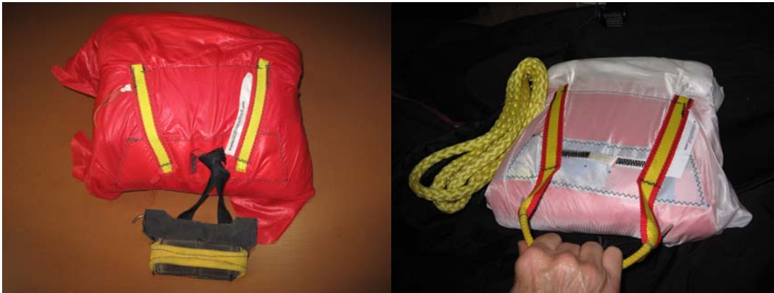
Incorrect handle attachment fig. 1

Your deployment bag should have 2 attachment points, using an extension handle reduces the control and speed of deployment.